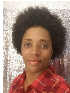
Kenya Banks 2 nd VP